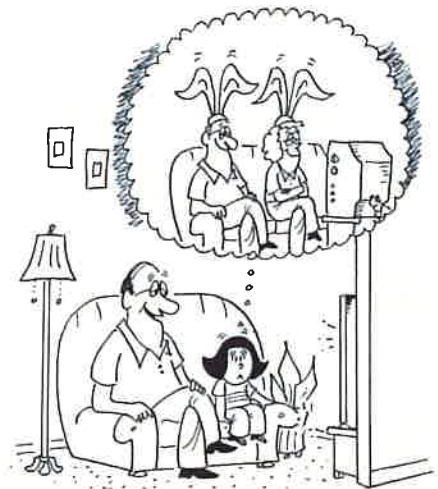
"In the old days, your Grandma and I watched TV with rabbit ears."